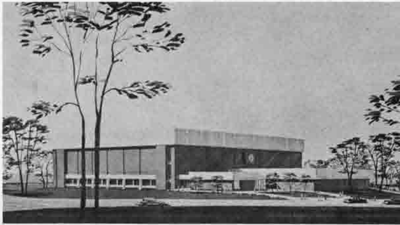
Shown above is the architect's drawing of the proposed $3 million Multi-purpose building. Bids for the structure were $500,000 over the allotted funds.

William Clay, Democratic congressional candidate in the First District, will speak at 12:40 p.m. Friday, October 4, in the "blue building." His speech is sponsored by the UMSL Young Democrats.