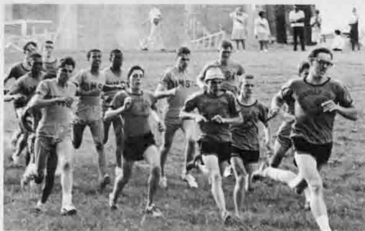
Greenville and UMSL harriers start off on their four-mile run around campus in last week's meet.