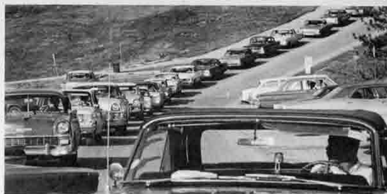
Friday, 4:30 p.m. and where it ends, no one knows . . . .

Construction equipment is clearing land south of Highway 70 off Florissant Road for a new University entrance. A two-lane road will go past the ML building to the front of the campus and Benton Hall. Completion is set for late this fall or early winter.